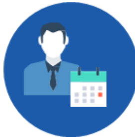
Free duvet day post-Christmas party