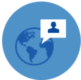
Global recognition of success