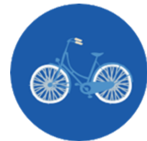
Cycle to work scheme