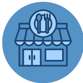
10% discount in local restaurants