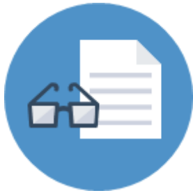
Free eye test