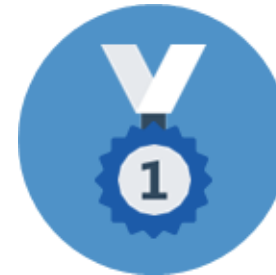
Weekly & Monthly office awards