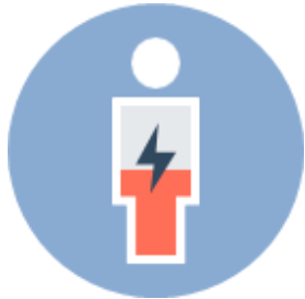
Private Healthcare for employees and dependents