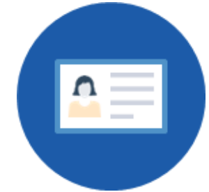
Season ticket loan